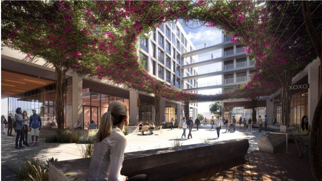
View from courtyard at 200 W Mesnager Street GBD Architects

The project follows on the heels of the Llewelyn, a 318-unit apartment complex which recently opened just south of the park. Several other mixed-income housing and offices are slated for properties bordering the Mesnager site, including a larger 376-unit live/work development pitched for Main Street.