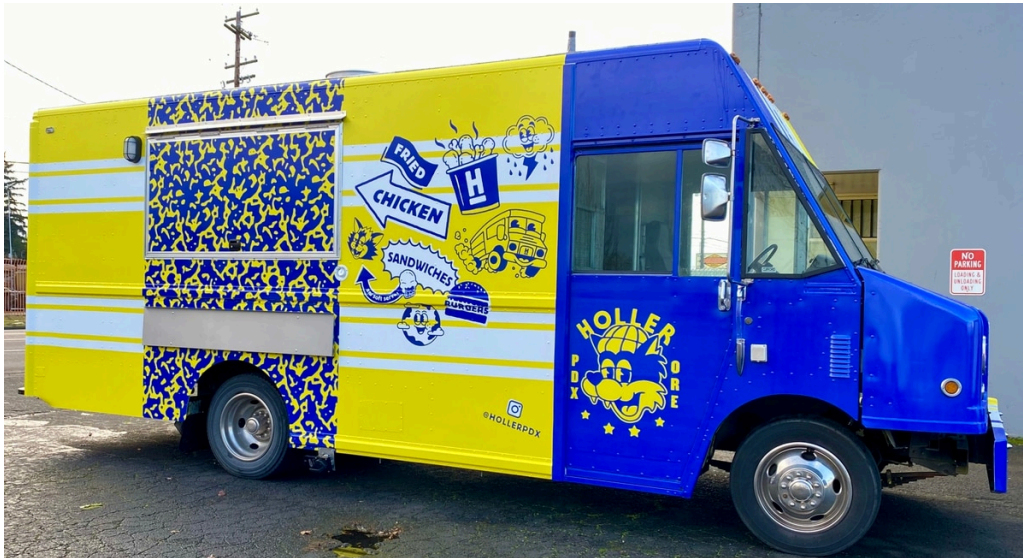
Holler's new food truck.

The casual chicken joint—launched in Sellwood last summer by the team behind downtown barbecue restaurant Bullard—now has a shiny new food truck