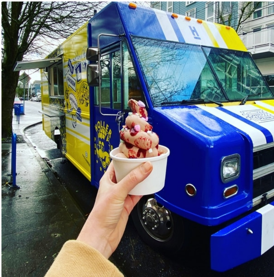
You can order some soft serve for dessert from Holler's food truck.

Once you've gotten your order from the bright blue-and-yellow poultry wagon, you can take it to wine barrels set up by Bar Norman to use as standing tables. During the pop-up, bottles of sparkling wine can be partnered with your meal for $25.