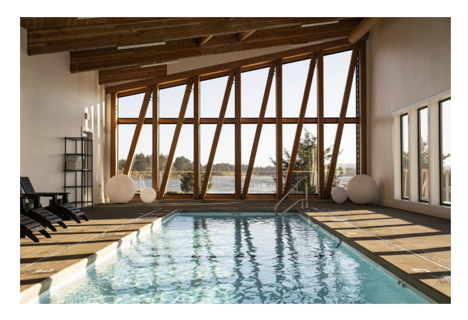
The indoor pool area needed to be durable and mold-resistant. "We selected a mix of solid and woven pieces from Restoration Hardware, Four Hands, and Palacek including a handsome woven lounge chair," says JHL's creative director Liz Morgan. "To add some fun and interest for nighttime swimming, we procured some waterproof globe lights that can sit on the pool deck and float in the water."