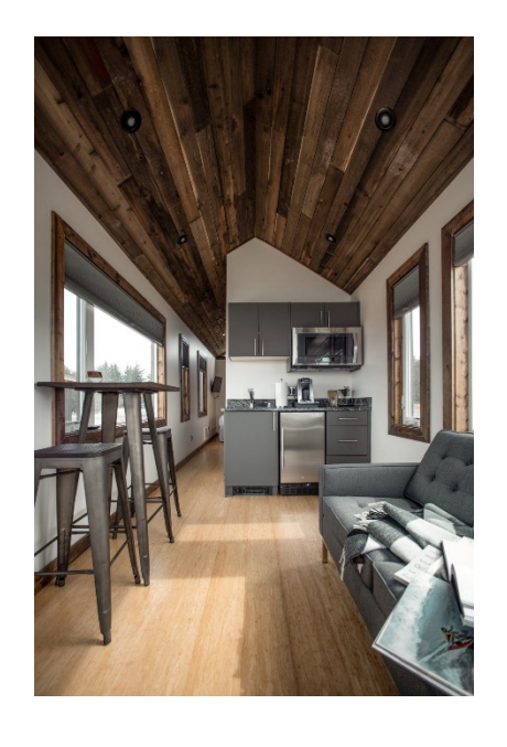
A pitched, tongue-and-groove ceiling adds a rustic feel.