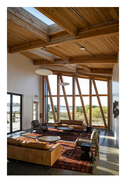
The high, angled ceiling and full-height windows provide perspective on the natural surroundings.