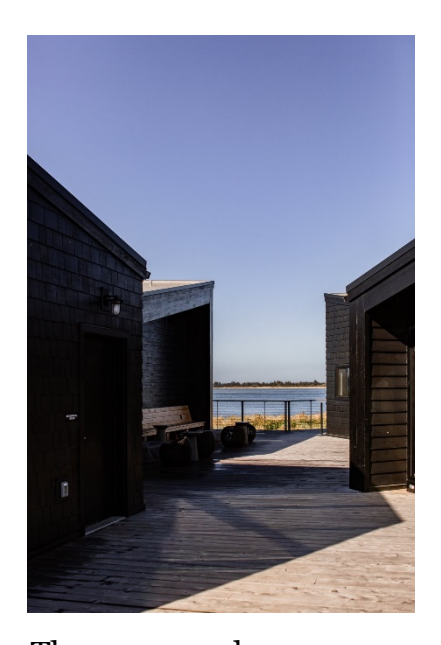
The communal areas are "pulled apart" to create space between each of the structures.

"The beauty of Bay Point is that this place is magical. When you're here, you're able to reconnect with nature, with yourself, with your family," says Robert. "You're spending time outdoors and coming back to modern comforts. We want guests to [walk] away feeling whole."