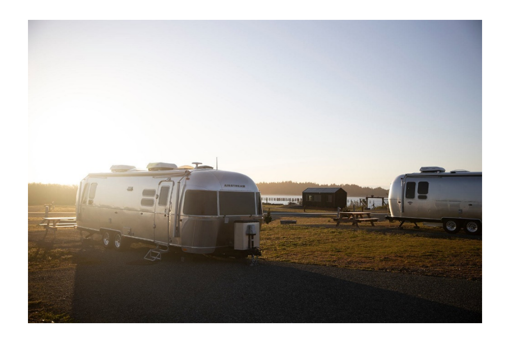
Bay Point Landing's updated Airstreams let you camp in comfort and style.