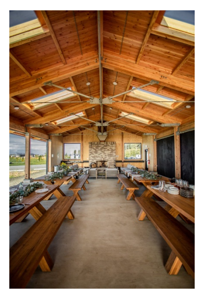
The Pavilion is an indoor/outdoor event space that is outfitted with long, communal teak dining tables.