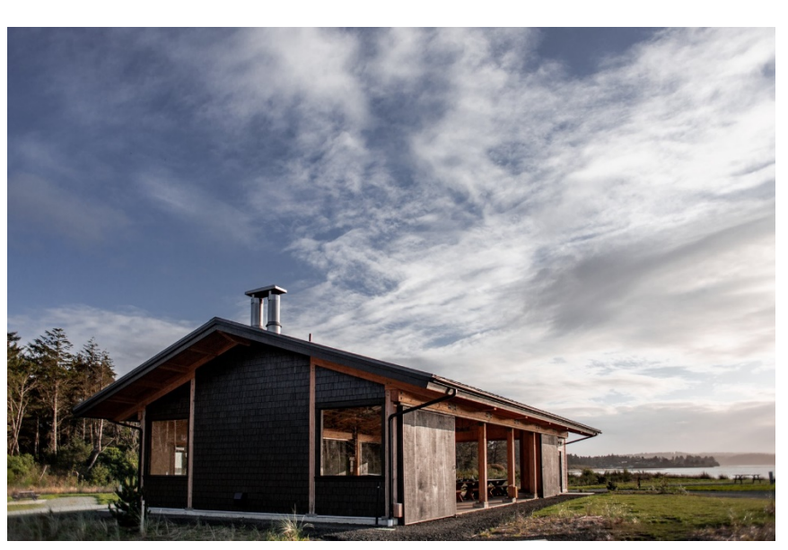
The Pavilion is oriented toward bay views.